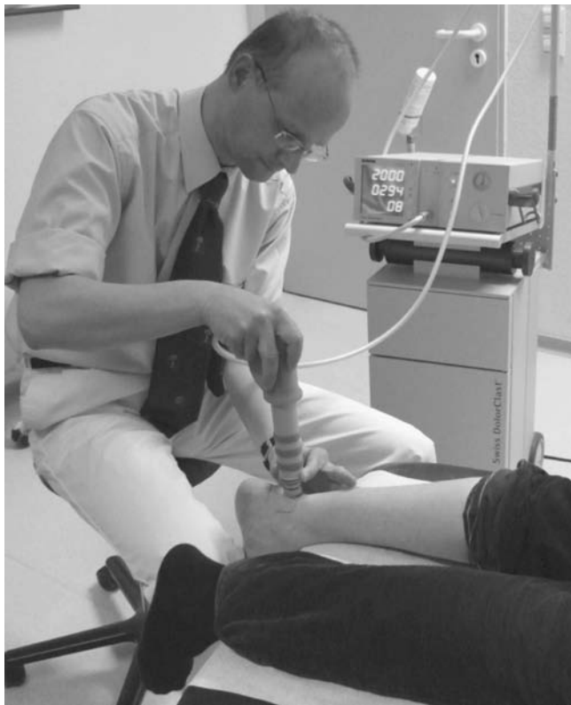
Figure 2. Application of shock-wave treatment.

sport, he or she automatically loses at least 10, and possibly 20, points.